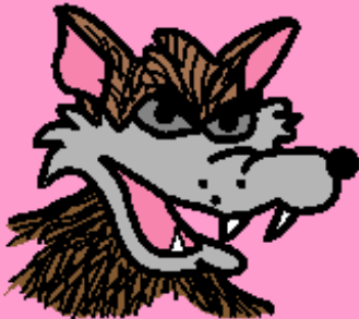
Wolf huffed and puffed